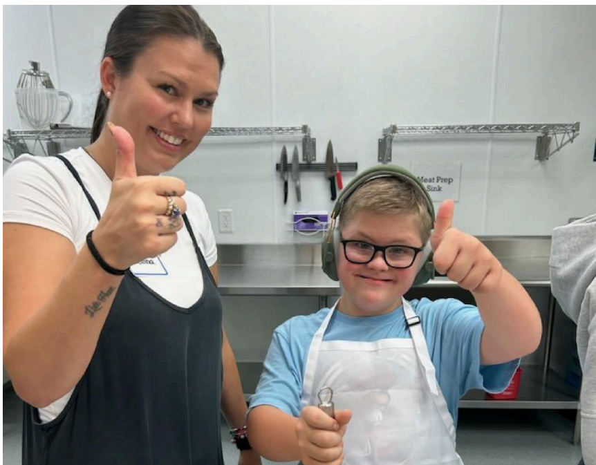
SOCIAL & RECREATIONAL OPPORTUNITIES

We believe every individual has the right to be accepted in their community and have similar opportunities as that of their peers. Our mission is to support, connect and provide resources for people with Down syndrome and their families in Southeastern NC. Raising awareness and educating our community helps others to include and clearly see the value of those with Down syndrome.