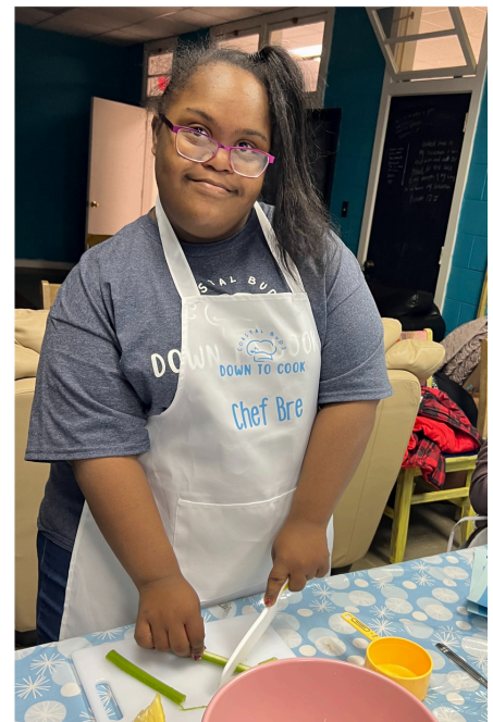
AWARENESS & OUTREACH